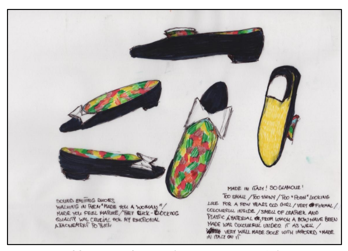
Figure 5: Workshop 4. Recollection of first pair of shoes (Drawing Lab, 2015).

For this workshop, students were asked to recall personal episodic information, specifically childhood memories relating to their first pair of shoes. They were asked to give form to personal items.