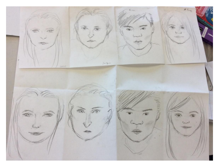
Figure 6: Workshop 5. Portraits drawn from subject and then redrawn from memory (Drawing Lab, 2015).

turned away from the subject, and drew a second picture of the subject from memory. Each person drew all members of the group. Feedback from this workshop described how students had memorised ratios and proportions to recall the distances between features and accumulated relevant information with each additional portrait. Participants reported an improvement in their ability to recall through repetition and heightened levels of focused concentration.