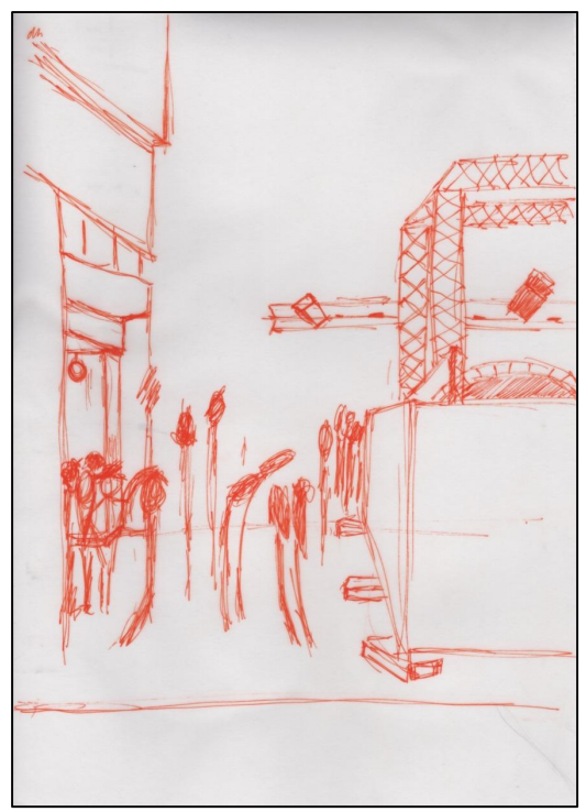
Figure 4: Workshop 3. St. Pancras Station, London drawn by the same student from memory, one week after workshop 2 (Drawing Lab, 2015).