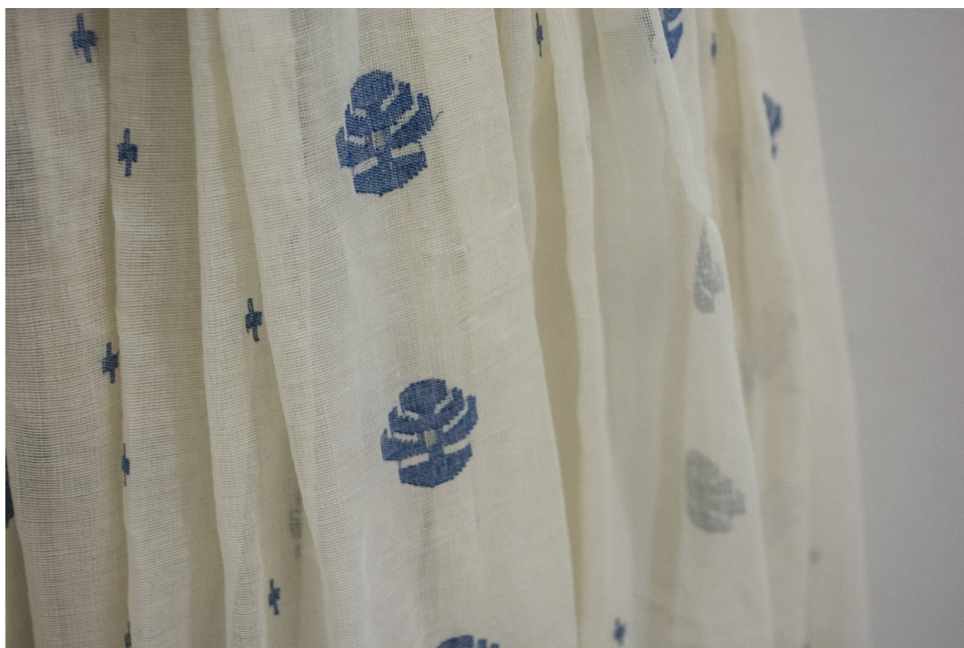
Figure 13: Making the dresses, hand-stitched pleats.