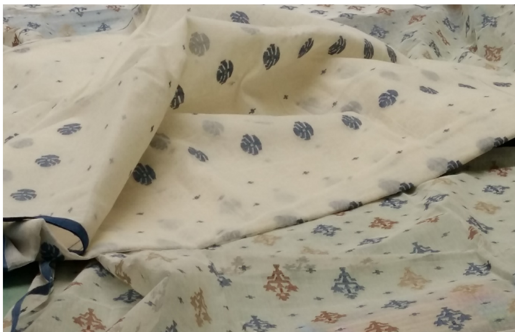
Figure 7: The Jamdani cloth on the studio table at LCF. The two cloths each had a different design: 'Bhager Phara' (tiger's footprint) on top of one incorporating a 'Puratan Bhuti' (ancient print) (see Figure 6).