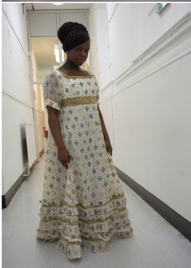
Figures 15 and 16: The final evening gowns, modelled by students who worked on the project.