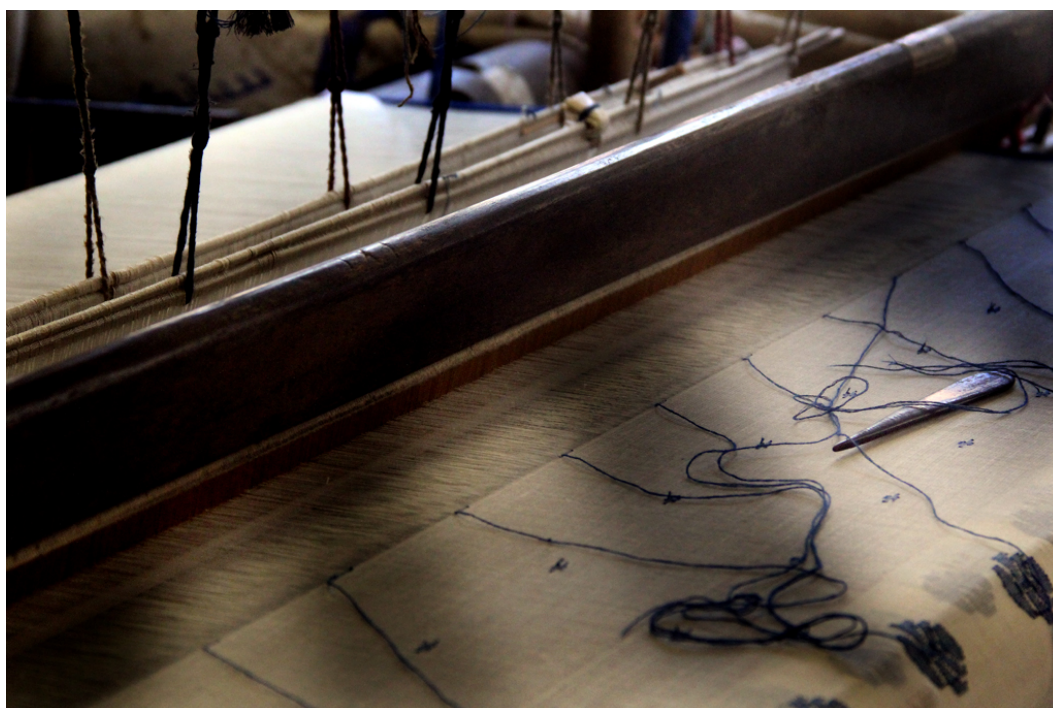
Figure 4: Motifs are sewn between the meeting places of the warp and the weft. Jamdanis are usually woven in soft shades of fine grey cotton, incorporating blue-grey or sometimes with cream-white coloured designs, comprising flowers in 'bhutidar' style (set all over) or 'tircha' (run diagonally) (Bhatnagar, no date).