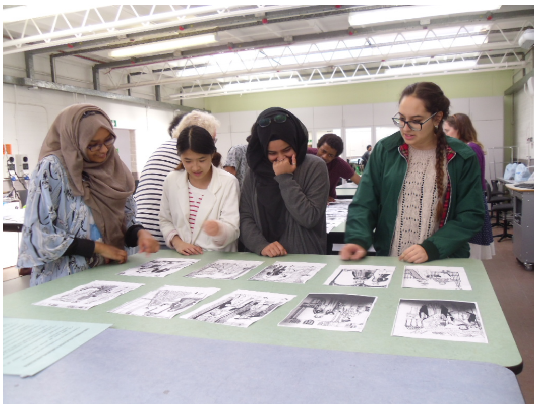
Figure 9: Students got to know each other through group discussions, during which they critiqued historical and cultural inspirations and viewed Regency evening gown designs.