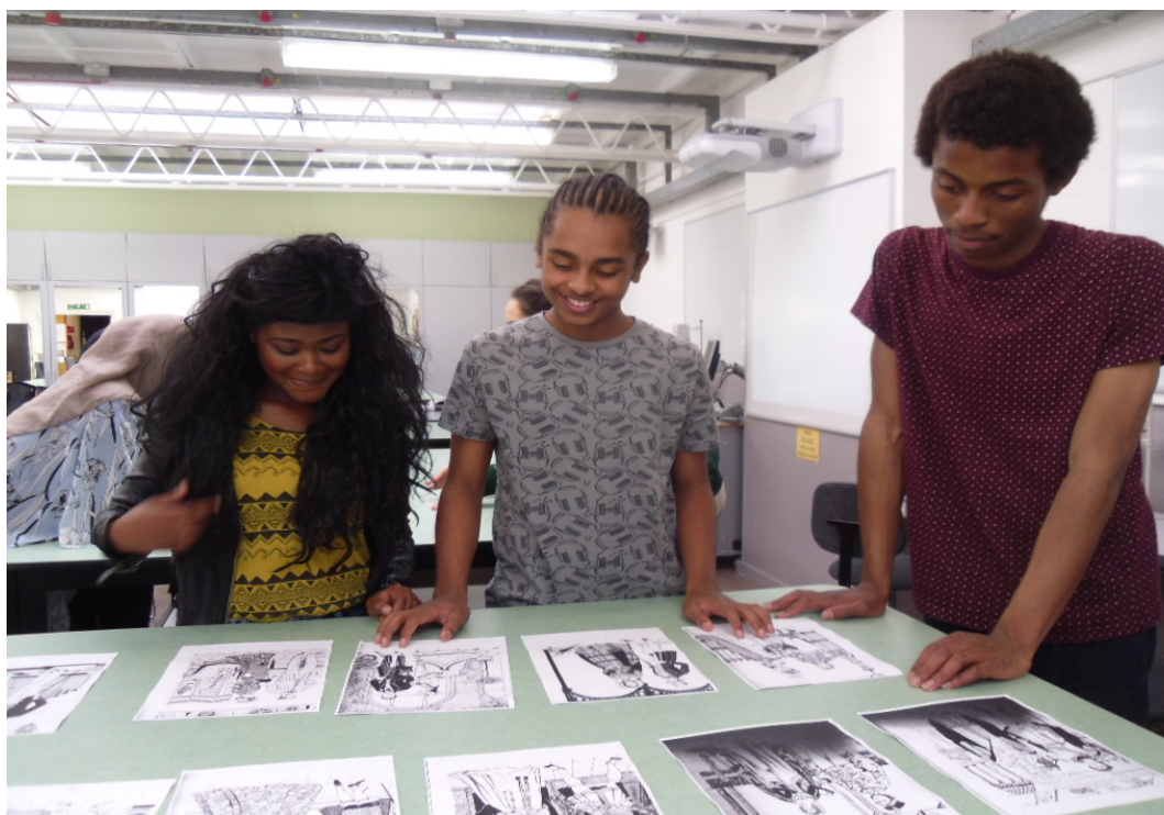
Figure 10: Tutors and students worked together on dress ideas.