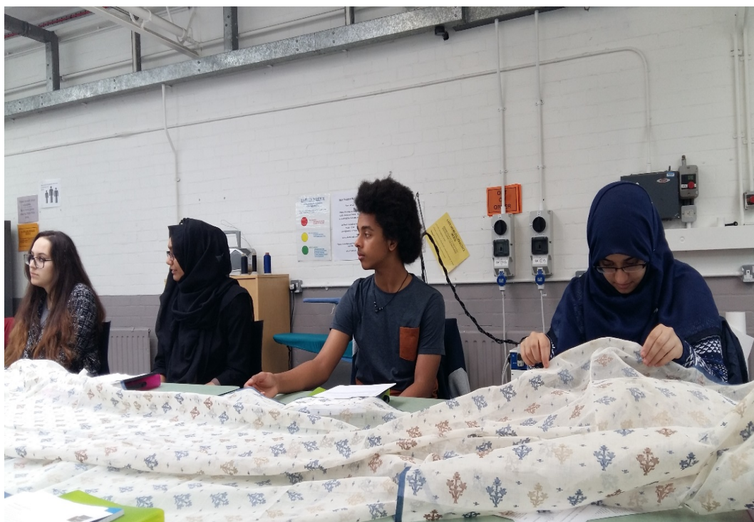
Figure 8: Students meeting for the first time and experiencing what it is like to work at LCF's studios. They learnt about where the fabric came from and handled the specially woven cloth.