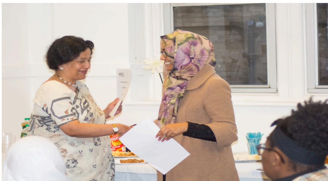
Figure 18: At the reception, the students who participated in the project received certificates. One student commented on being delighted to 'receive my own sewing kit and working with different ages in a studio' and another student said he particularly 'enjoyed learning how to do the back-stitch'.

The project has provided an opportunity for young people to learn about the skills involved in historical sewing techniques and working with Jamdani. Participating in the project has helped them acquire transferable skills and improve their chances of future employment in their