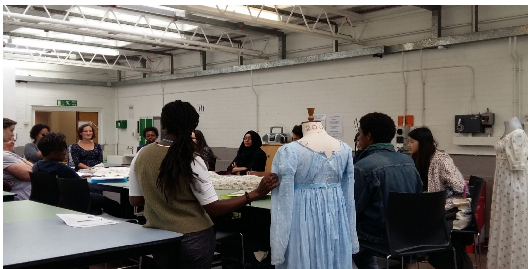
Figure 12: Students and tutors at the LCF studios in Mare Street. In this session they learnt about the use of muslin during the 'Jane Austen' era. Students had the opportunity to touch, feel and explore the stitching of two Regency style dresses made out of muslin. The garments were created as part of a project run by the Brick Lane Circle and Stepney Trust entitled 'How villages and towns in Bengal dressed London ladies in the 17th, 18th and early 19th centuries' (2013).