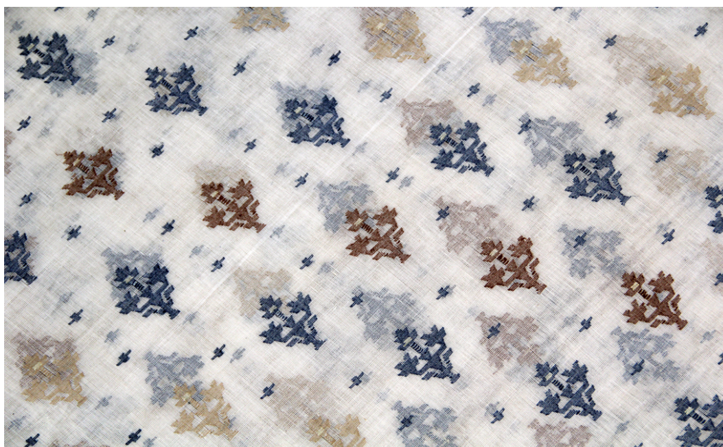
Figure 6: Detail of the Jamdani's motif, a 'Puratan Bhuti' (ancient print) pattern. This, and another cloth were created specially for this project.