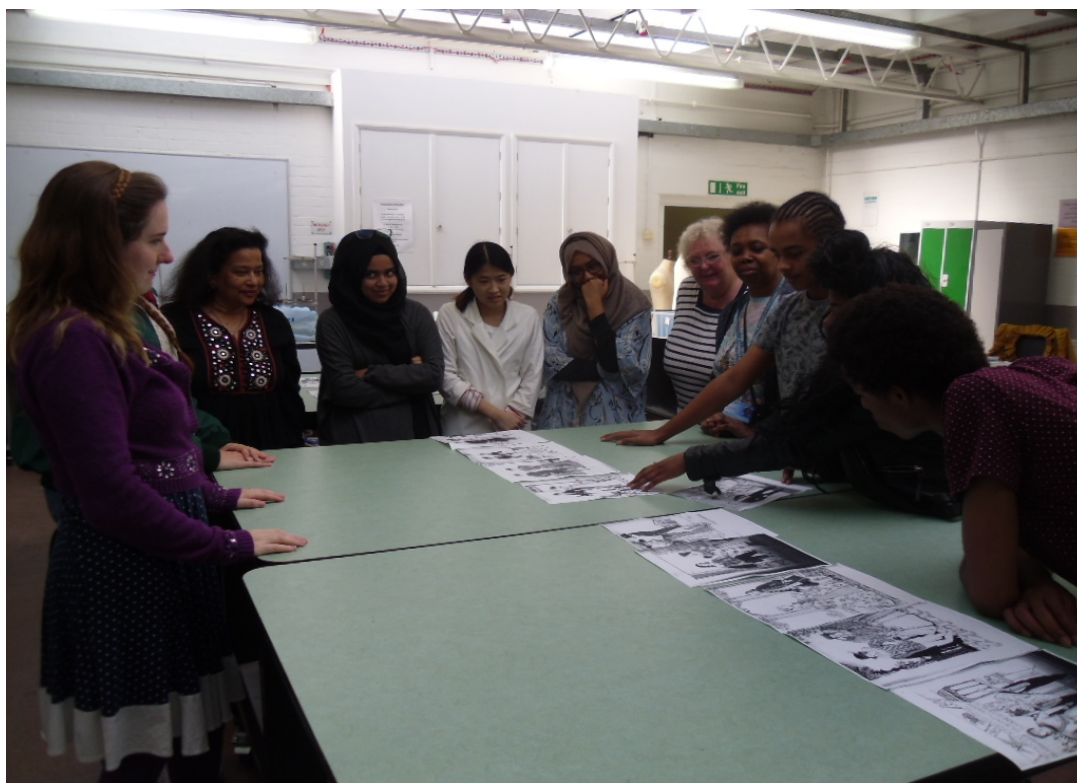
Figure 11: The tutors encouraged students to provide feedback, which allowed for collaborative, further development of their initial ideas.