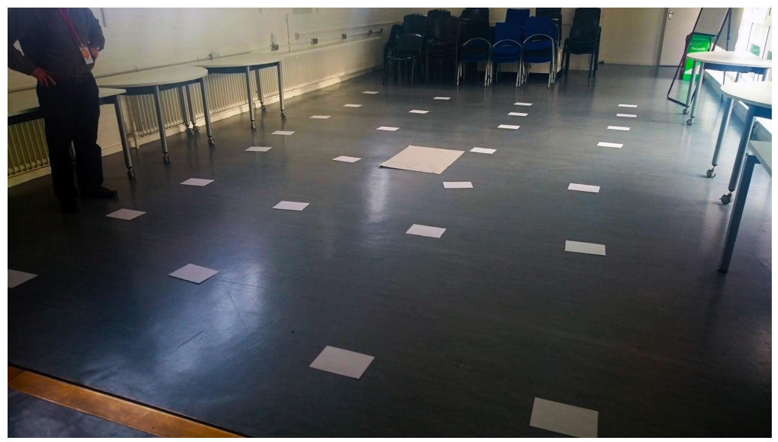
Figure 1: The room before the session started, taken from the 'front' of the room, opposite the door.

however, chose to move – in some cases participants remained in the position or area which they had originally selected, participating only in the discussion group which was tied to the part of the room they had originally elected to stand in. During the discussion phase of the workshop, it also became apparent that the least active discussion was taking place at the rear of the space, opposite the door.