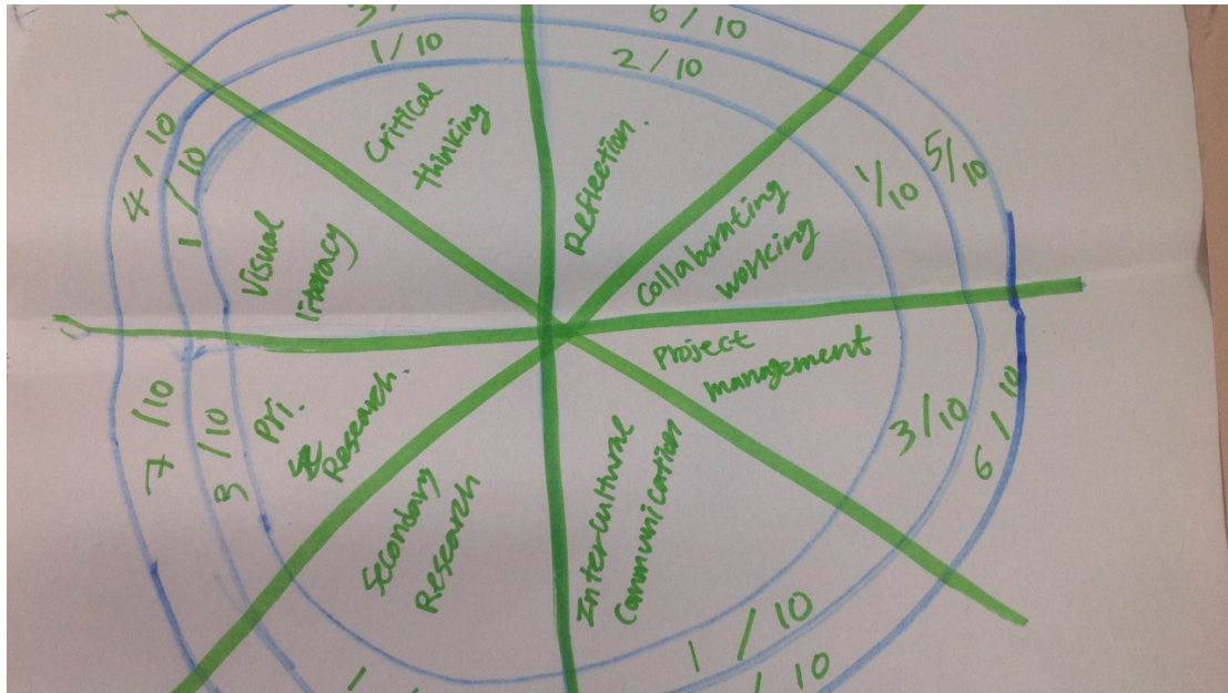
Figure 4: The 'wheel of reflection': a chart made by IPF students, comparing their skills at the start and end of the Global Citizenship Project (Autumn term, 2014).

This exercise revealed that more experienced students gained thinking and learning strategies, project management skills and an awareness of application and synthesis within a range of different disciplines. Feedback from this activity revealed that many students indicated that they had started to develop a relationship with their local environment and London as a resource for research.