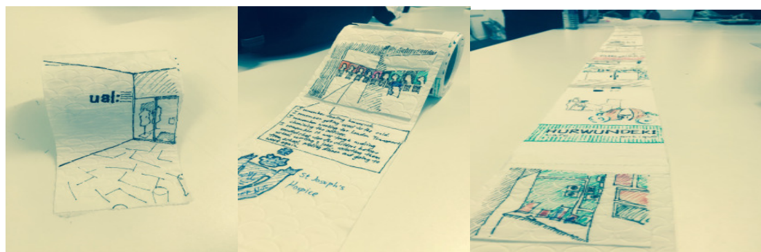
Figure 3: Hackney on a toilet roll, Group 3 (2014).

The third group responded to their initial, rather negative first impressions of Hackney. Students discovered a number of layers within the communities of Hackney and represented this through a series of original sketches, drawn on a toilet roll.