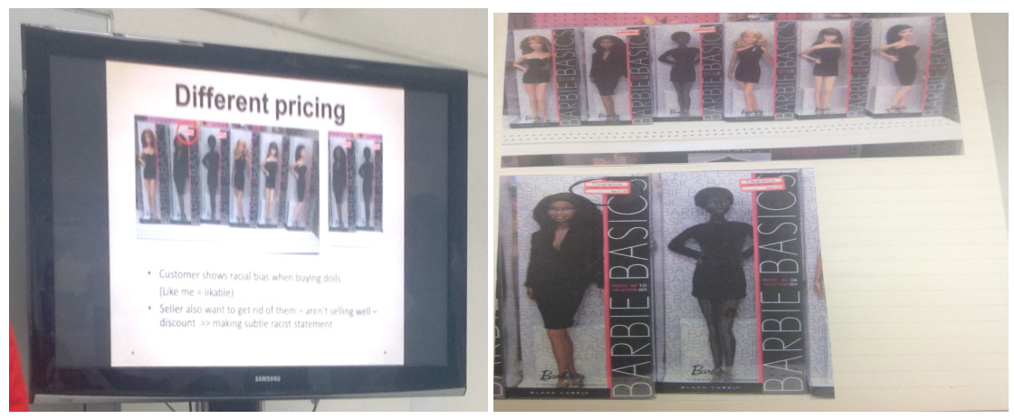
Figure 2: An analysis of representations of race through the sale of Barbie Dolls, Group 2 (2014).

I realised that the world is a big system where everything is linked together, but not always in the way we expect. I began to notice the global influence and cultural representations in our daily life. Every second of my life I use everyday objects which I never paid attention to before now. It was very useful for me to start thinking of simple things more deeply or in a different context – it will help me to be more creative. (IPF student, 2014)