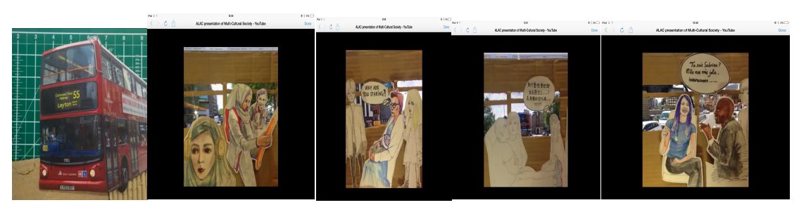
Figure 1: The number 55 bus, stop-motion video, Group 1 (2014).

The first project group responded to the number 55 bus route that connects three LCF sites: Mare Street, High Holborn and John Prince's Street. Students within this group created a stop motion video that included their own sketches, representing their reflections on bus travel in London and how it serves as a leveler: a space where a cross-section of demographics coexist for a shared purpose.