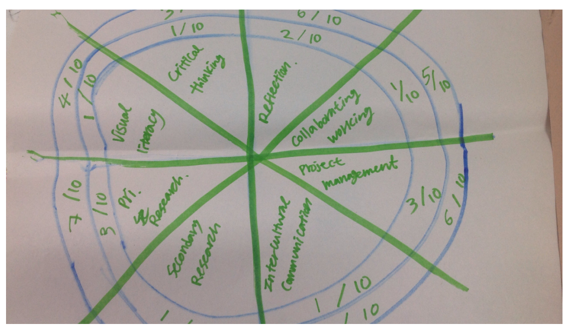
Figure 4: The 'wheel of reflection': a chart made by IPF students, comparing their skills at the start and end of the Global Citizenship Project (Autumn term, 2014).

This exercise revealed that more experienced students gained thinking and learning strategies, project management skills and an awareness of application and synthesis within a range of different disciplines. Feedback from this activity revealed that many students indicated that they had started to develop a relationship with their local environment and London as a resource for research.