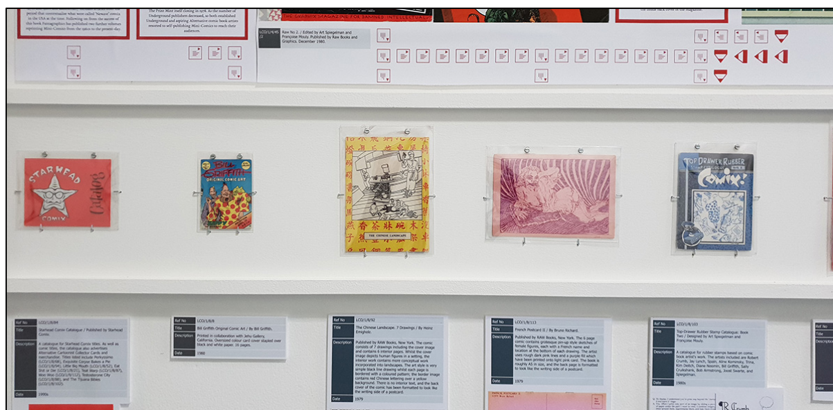
Figure 2: Exhibition Into/Out of the Box (LCC, 2018). Captions displayed in the style of the archive catalogue.

As well as deconstructing the process of cataloguing, the exhibition allowed visitors to participate in the cataloguing of material. Facsimiles of six of the comic books in the collection were made in order to allow any visitor to the exhibition to pick up and read through the comics. These were displayed alongside their caption (the catalogue description) and a box attached to the wall, with blank catalogue cards on which visitors could write their own descriptions (see Figure 3, below). We had a very good response to this, and these user-generated descriptions are hugely varied and very different to the neutral tone of the catalogue. They provide an alternative description and way of viewing and interpreting the material at hand and allow visitors to the exhibition (many of them UAL students) to direct and influence the catalogue. The intention is that we will utilise any pertinent information from these user-generated descriptions and add it to the archive catalogue itself.