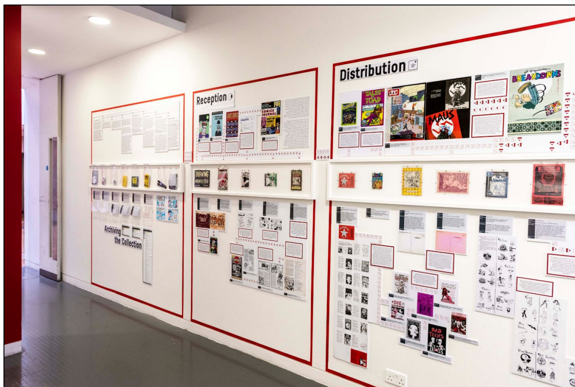
Figure 1: Exhibition: Into/Out of the Box (LCC, 2018). View of exhibition from corridor.

only very recently occurred, which made them an ideal series to highlight the issues around archival cataloguing.